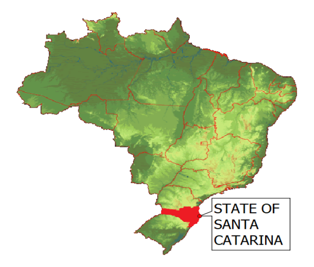
{\bf Fig.~1} - Higlight in red of Santa Catarina in the map of Brazil.

Santa Catarina is a state in the Southern Region of Brazil, and presents many geological formations that present a fundamental part on the type of soil that occurs on the region and in the choice of economical activities performed by its people. One way of classification is by the different plateaus that occur throughout the state, seen often in official reports (EPAGRI, 1999. To achieve said classification, the following soil properties are analysed: geological formation of origin, texture, CEC (Cation Exchange Capacity), bases saturation, drainage, depth of horizons, topography, etc. The properties these give to the soil interfere directly with choosing what economic activity will take place in a specific area, and in the productive response that the soil will present to the chosen activity.